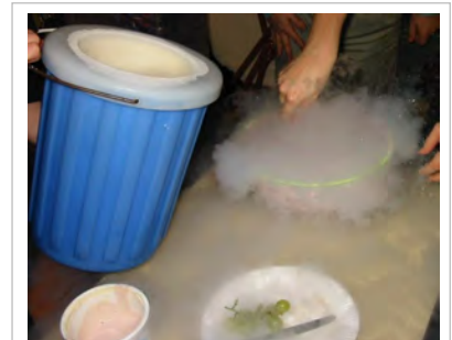
Lone Star A&M students preparing homemade ice cream with liquid nitrogen